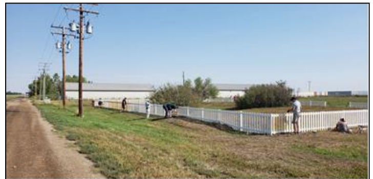
Volunteers applying the primer coat of paint to the new fence on August 22