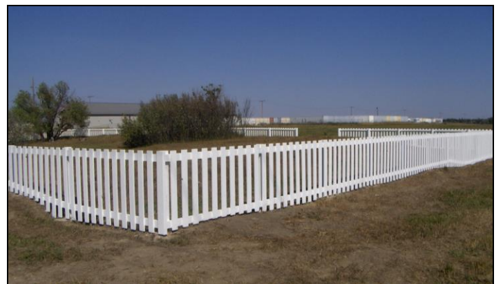
New fence with final coat of paint -- August 29.