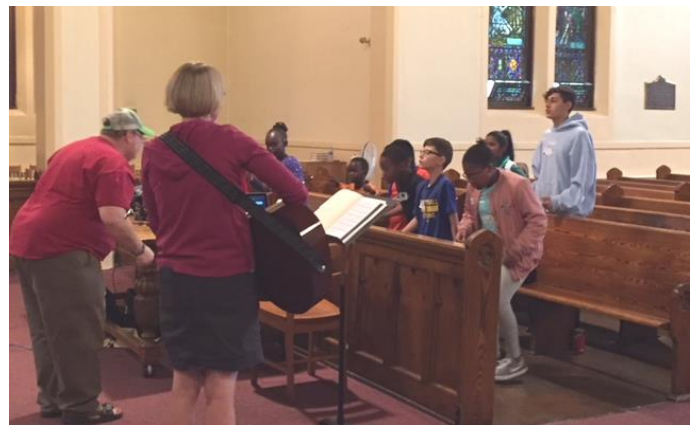
Singing at First