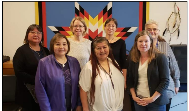
NIMC Executive and PCC Staff