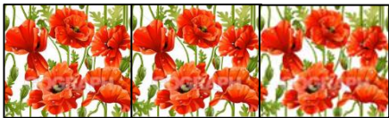
The Red Poppy by Larry Tickel

The red poppy is a symbol to simply show we care For all our fallen heroes, a loss we all equally share