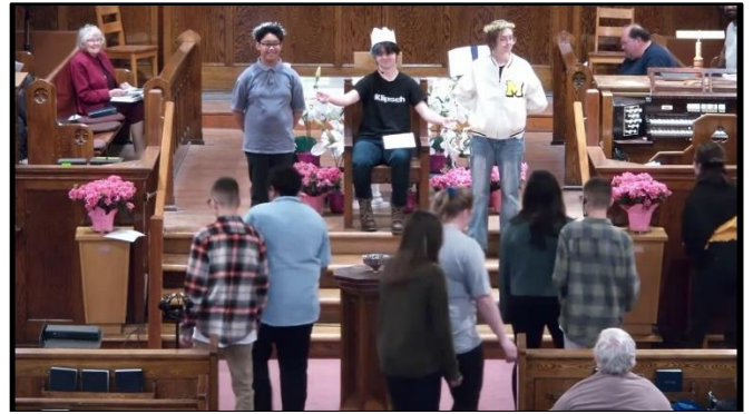
Dramatic Gospel reading – SPY weekend