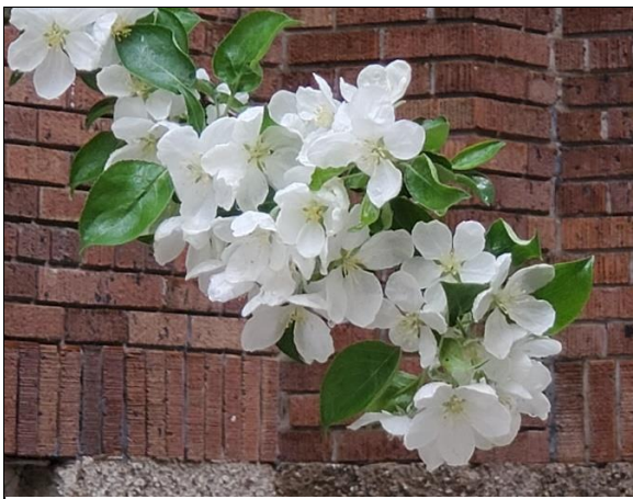
Apple blossoms from the courtyard tree