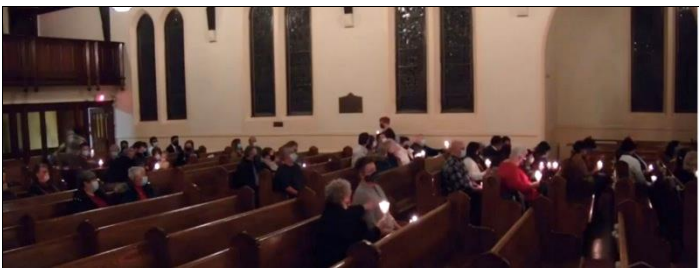
Christmas Eve 2021 - Congregation

In early January, as we began to get news of the rapidly rising Covid case numbers in our city and