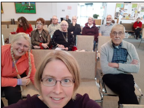
Regina gathering to celebrate the 75th Anniversary of the Canadian Council of Church at the Living Spirit Centre (Oct. 26)