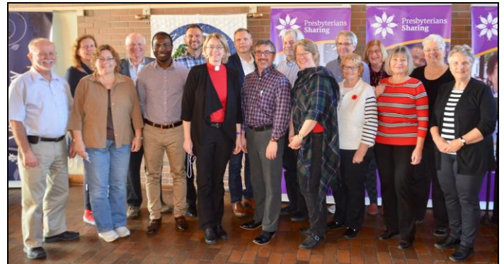
Life and Mission Agency Committee meeting in Toronto (Nov. 4-5)