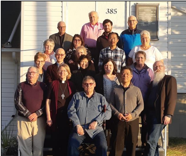
The Synod of Saskatchewan meeting in Briercrest (Oct. 18-19)

Serving as Moderator of the 2019 General Assembly includes a lot of travelling. I have been on several trips since the last issue of First Things First and I would like to share with you some of the highlights in photos.