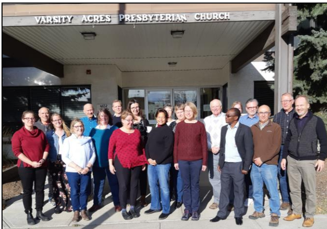
Presbyterian World Service & Development Committee meeting in Calgary (Oct. 24-25)