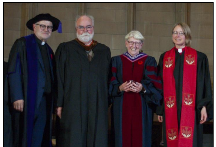
At the 175th Anniversary of the founding of Knox College, Toronto (Nov. 5)