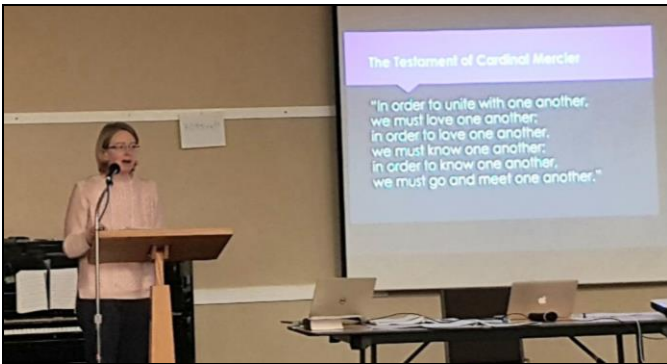
Assembly Council meeting at Crieff Hills Community, ON (Nov. 24-26)