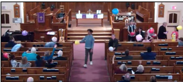
It's a Party!